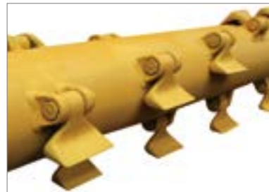
Rotor with flails - optional with Y-flails