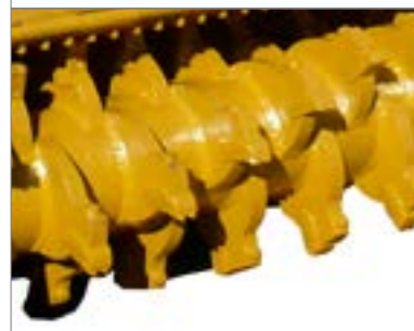
Rotor with fixed hammers

Hammers made of wear-resistant steel; recommended for work on the soil surface, maintenance of forest and forest roads, and electric lines and pipelines > MINIFORST cl · MIDIFORST dt hyd