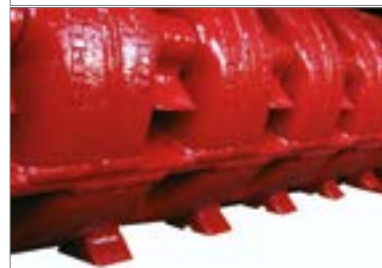
Forestry rotor with swinging hammers

Flails or Y-flails/knives for agriculture and greenspace maintenance > SMWA skid steer · SMO skid steer