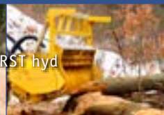
SMWA skid steer