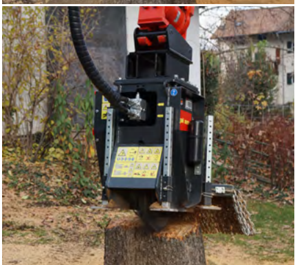
▶ YouTube www.youtube.com/seppimulcher