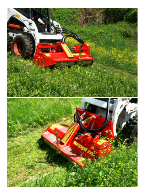
► YouTube www.youtube.com/seppimulcher